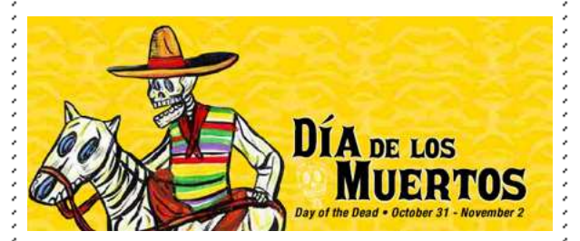
Día De Los Muertos Day of the Dead History Website

What Do Mexicans Celebrate On The Day Of The Dead?