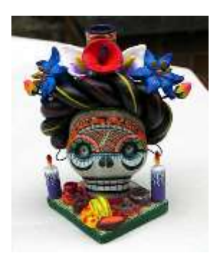
Día de los Muertos Day of the Dead Altars Website