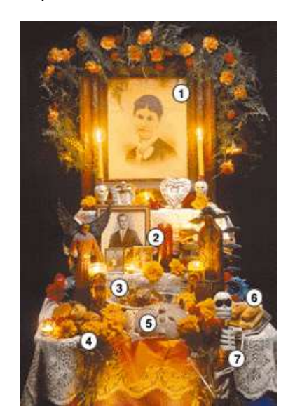
Día de los Muertos Day of the Dead Altar

The Day of the Dead is a time for the dead to return home and visit loved ones, feast on their favorite foods and listen to their favorite music. In the homes, family members honor their deceased with ofrendas or offerings, which may consist of photographs, bread, other foods, flowers, toys, and other symbolic offerings.