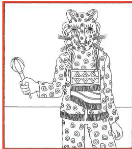
Coloring Book Jaguar Costumed Figure

The Folk Art of Latin America: Visiones Del Pueblo Family Guide Marion Oettinger, Jr. 1992.