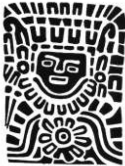
Flat Stamp Masked Figure with Headdress

In ancient Mexico, clay stamps were introduced to a new technique, the mold-made stamp, for mass production. The stamping process was frequently used to decorate pottery. It was applied to the surface of the vessel when the clay was still pliable. The result was a decoration in relief. Sometimes the stamps were used as a mold to make the whole vessel with its decorations.