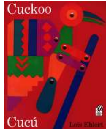
Cuckoo: A Mexican Folktale Cucu: Un Cuento Folklorico Mexicano Lois Ehlert. New York: Harcourt Brace and Company. 1996.

Create a simple wooden folk art toy by using materials such as colored paper, cardboard strips, paper brads, and imagination. [See Wooden Folk Toys in the handouts for a pattern and student art.] Cuckoo: A Mexican Folktale Cucu: Un Cuento Folklorico Mexicano , by Lois Ehlert is a great for inspiration and ideas for folk art toys.