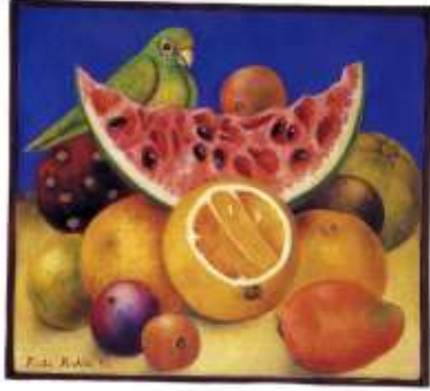
Still Life With Parrot