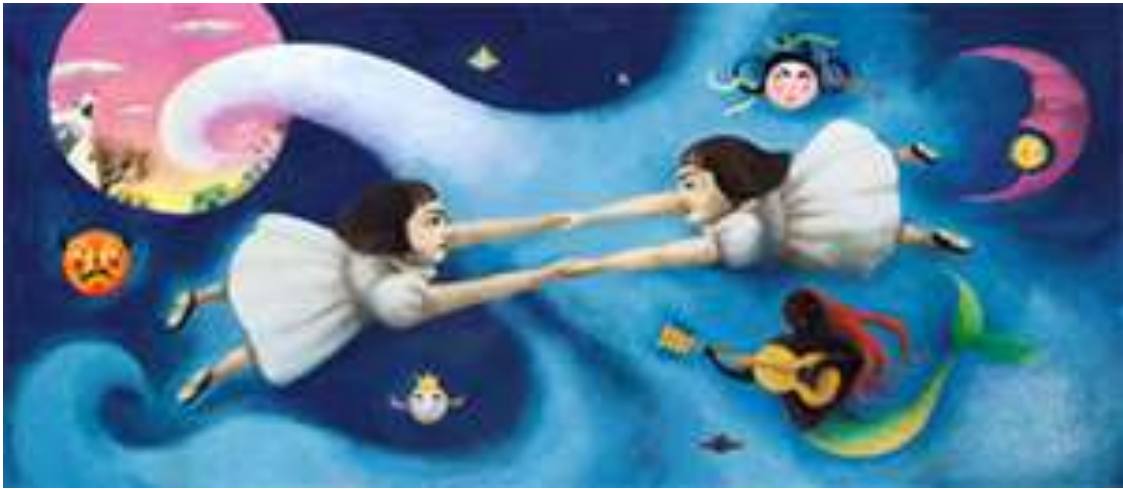
Enter, stage left: Frida's imaginary friend. Her name is also Frida. They play games. Frida