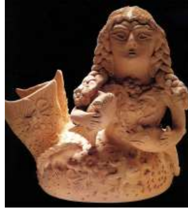
Mexican Ceramic Mermaid Girard Collection Museum of New Mexico, Santa Fe

What other folk artists have created mermaids? Compare the techniques of paintings to carved clay folk art.