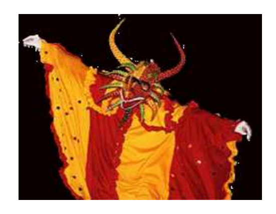
Vejigante Masquerader El Boricua A Cultural Site - Puerto Rico http://www.elboricua.com/vejigante1.html

Divide students into small groups. Work with each group to find out more about the history of Vejigante masks [See Resources section for helpful Internet websites]. Finally, guide students to make their own Vejigante masks out of papier-mâché or make drawings of masks, use the coloring book illustration of Jaguar costumed figure, or make finger puppets of masked figures. (Excellent pictures can be found in books listed in the Resources)