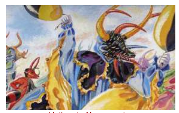
Vejigante Masquerader Lulu Delacre 1993 Illustration Page 23

The book and video set The Vejigante and the Folk Festivals of Puerto Rico tells the legend of the Vejigante and how he still appears today in carnival celebrations in three cities in Puerto Rico. The book gives insight into the differences in style and symbolism in these three festivals and is illustrated with beautiful drawings to color. The video The Legend of the Vejigante contains actual footage of the carnival celebrations plus detailed instructions on making the papier-mâché mask the Ponce Vejigante wears.